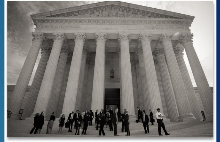
Photo: Kahler v. Kansas argument, US Supreme Court, March 2022