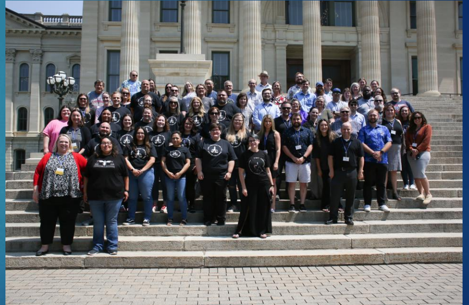
Group Photo of Public Defender Office Employees and Assigned Counsel in attendance at BIDS Annual Conference, June 2023.