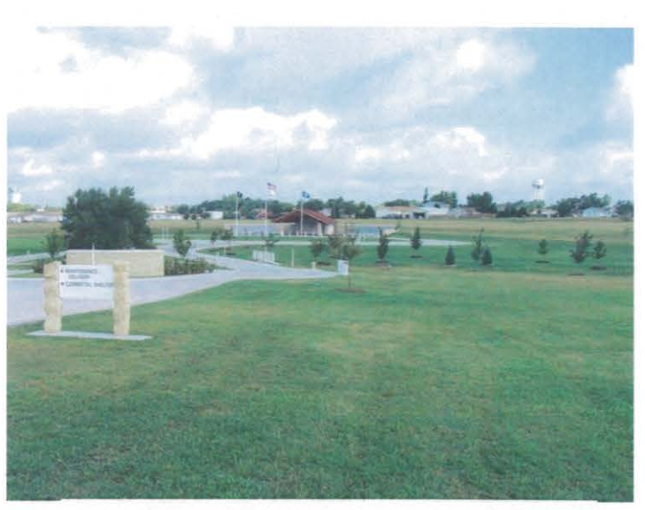
Kansas Veterans' Cemetery at WaKeeney (opened in 2004)