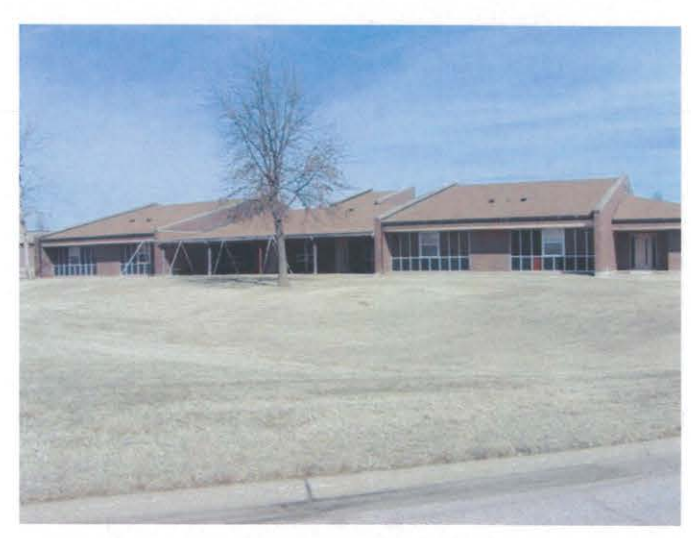
Donlon Hall (Assisted Living)