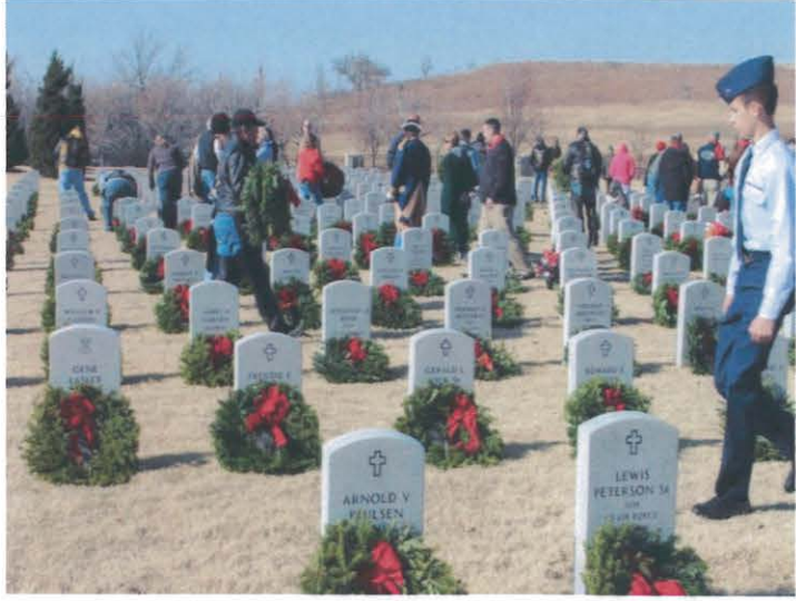
Wreaths Across America (Kansas Veterans Cemetery at Winfield)