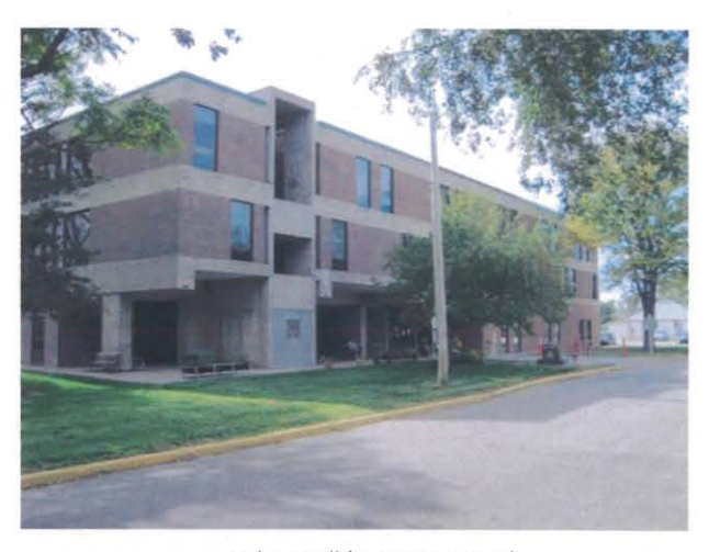
Halsey Hall (Long-term Care)