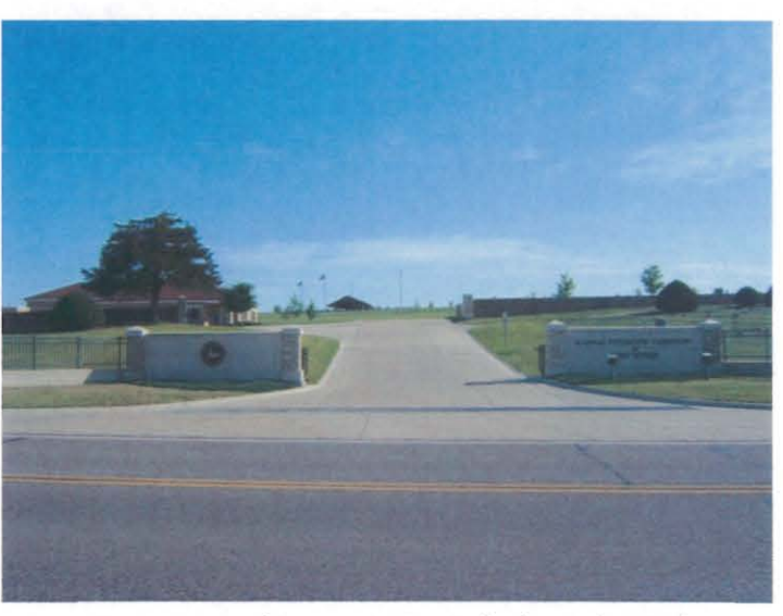
Kansas Veterans' Cemetery at Fort Dodge (opened in 2002)

The construction of these cemeteries was funded 100% by federal grants from the Department of Veterans Affairs National Cemetery Administration, State Cemetery Grants Programs.