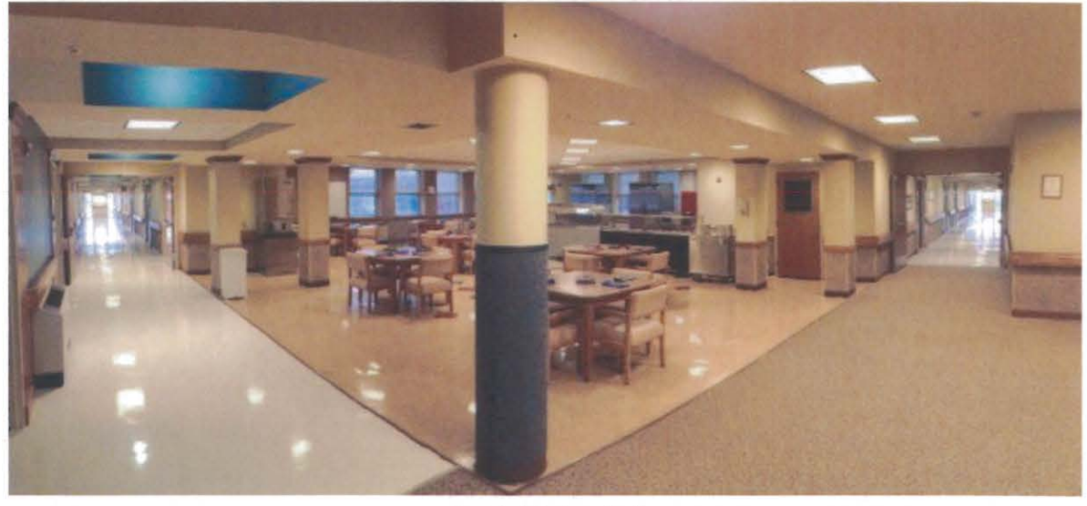
Inside Triplett Hall

Ribbon cutting ceremony for Triplett Hall