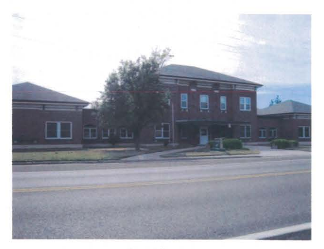
Lincoln Hall (Domiciliary)