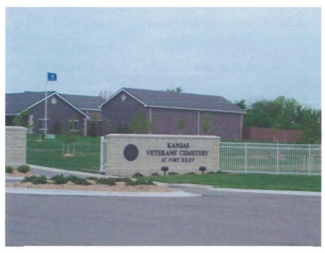
Kansas Veterans' Cemetery at Fort Riley (opened in 2009)

Spouse, surviving spouse, and dependent children are eligible for interment, even if the veteran is not buried in a Kansas State Veterans' Cemetery. The veteran must have met military service requirements. This includes lost or buried at sea, missing or missing in action, or a veteran whose remains have been donated to science or cremated and the ashes scattered.