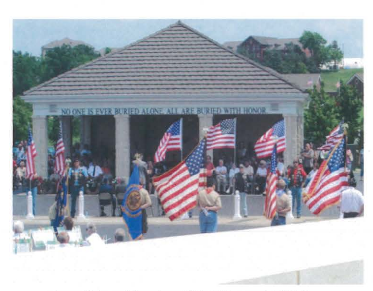
Kansas Veterans' Cemetery at Winfield (opened in 2004)

The VA National Cemetery Administration conducted a Triennial review of all four State Veterans Cemeteries during the week of July 9-13, 2012. All four cemeteries passed the Triennial review and received the "Excellence of Appearance Award".