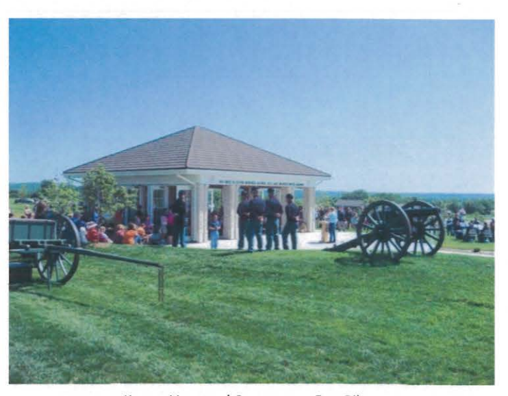
Kansas Veterans' Cemetery at Fort Riley