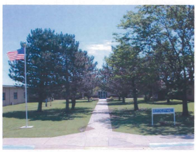
Bleckley Hall (long-term Care and Special Care)