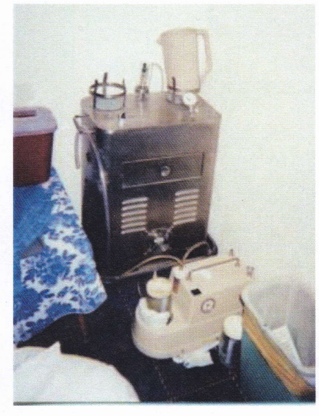
Unsterile surgical bedside with open trash and dirty carpet