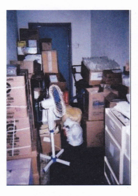
Fire hazard blocked back exit with lawn mower as a "back-up generator"