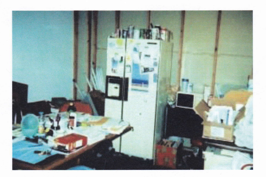
Combination lunch room/drug prep/aborted fetus storage/patient files