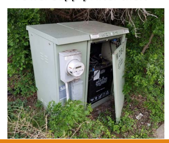
With Security bar installed