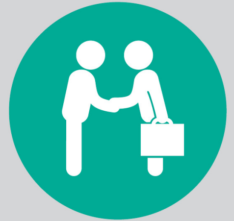
Sustaining today's workforce