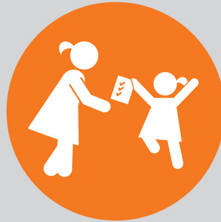
Families who need financial assistance to afford services