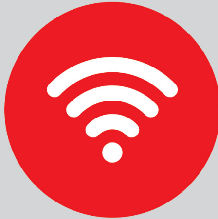
Those with limited internet access