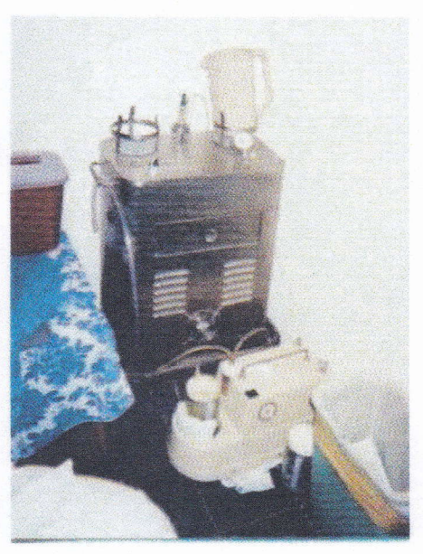
Unsterile surgical bedside with open trash and dirty carpet