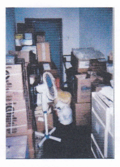
Fire hazard blocked back exit with lawn mower as a "back-up generator"