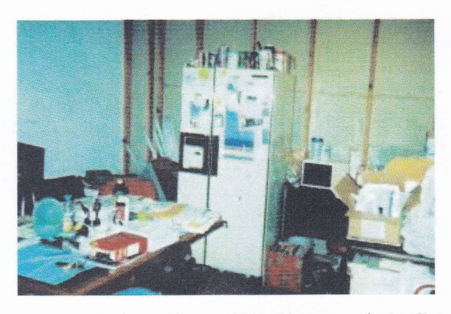
Combination lunch room/drug prep/aborted fetus storage/patient files